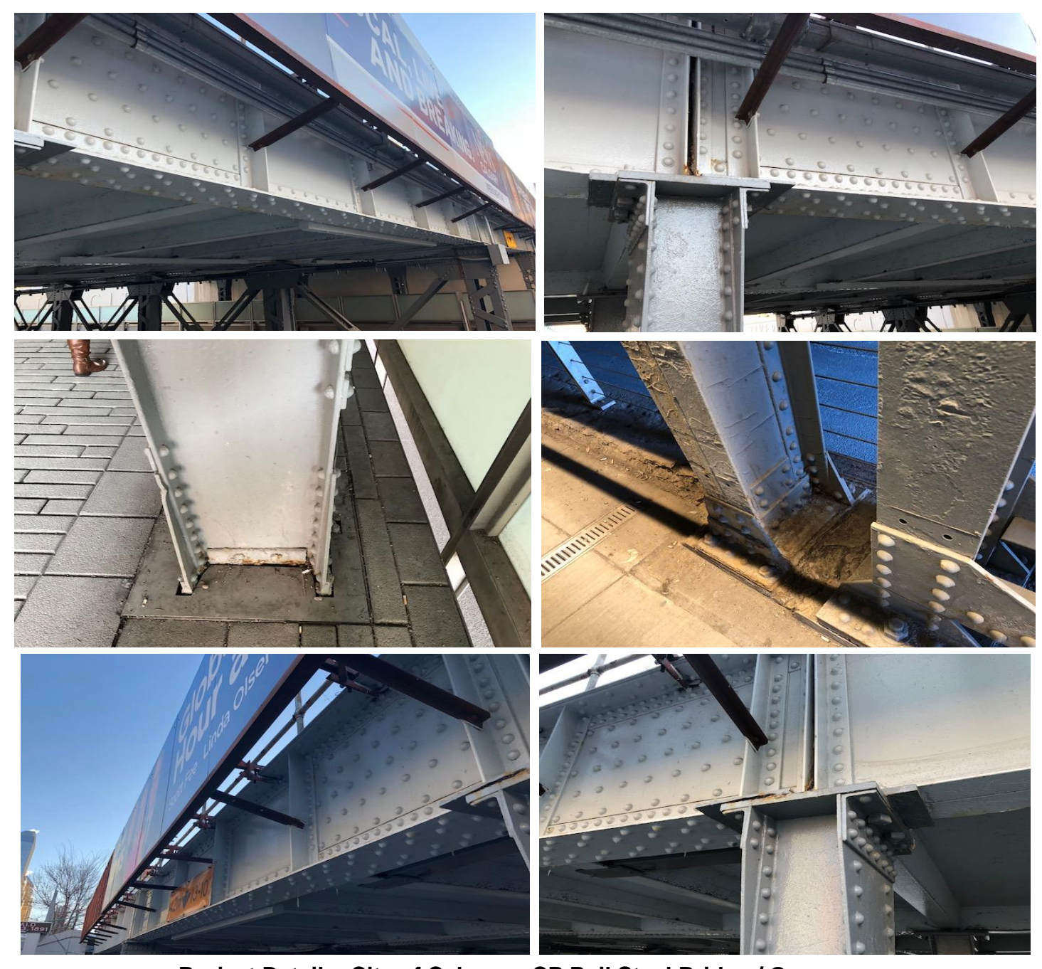
Project Details: City of Calgary - CP Rail Steel Bridge / Overpass Encapsulation of lead-based paint and rust.